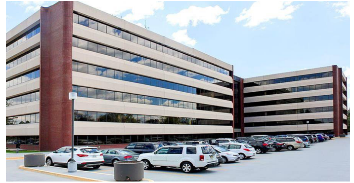
ROSETREE CORPORATE CENTER MEDIA, PA Electrical design of a new backup generator.