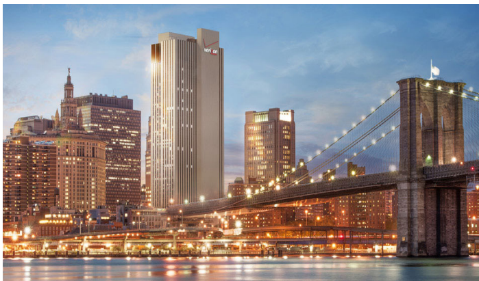
SABEY NEW YORK, NY MEP design for a Class "A" office fit-out on the 14th floor of a NYC high rise. This was a self-certification project for NYC.