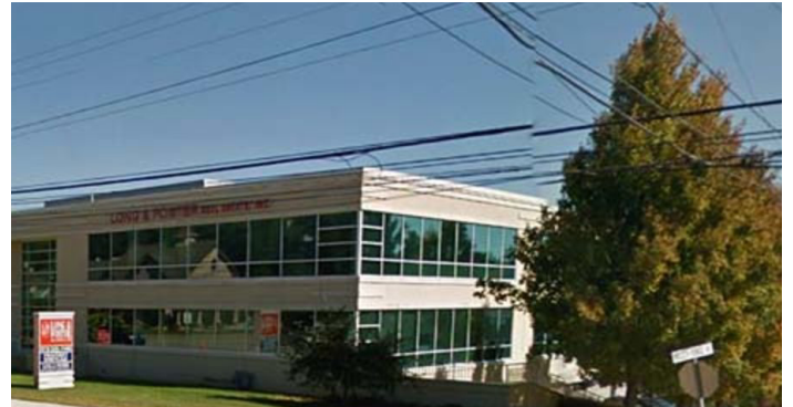
DEVON OFFICE BUILDING PHILADELPHIA, PA Electrical design for the new construction of a mix use office / apartment building.