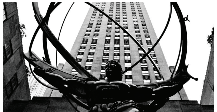
FRANKLIN MINT CREDIT UNION FOLSOM, PA MEP | FP design for the 45,000 SF tenant fit-out.