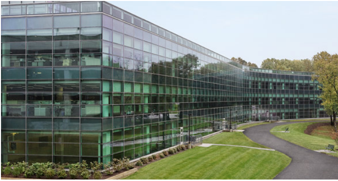
SAP AMERICA, INC. NEWTOWN SQUARE, PA MEP office renovation.