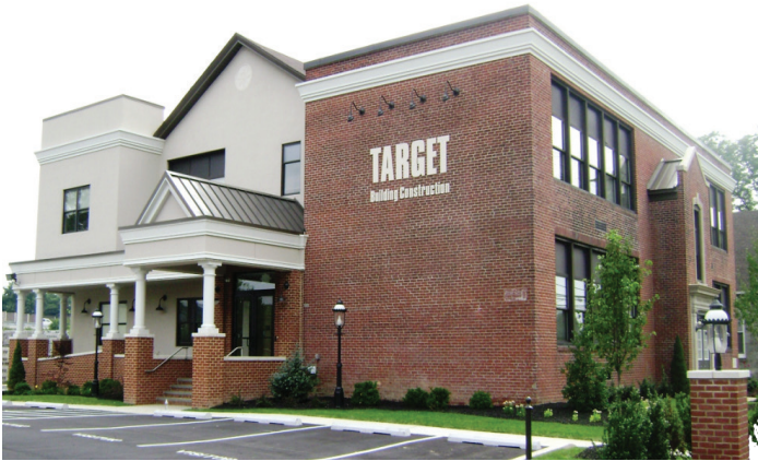
TARGET BUILDING CONSTRUCTION CRUM LYNNE, PA MEP engineering services for a two story 11,000 SF office building.